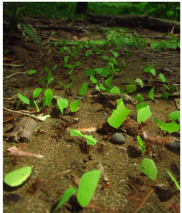
Figure 1. Leafcutter ants: The ultimate superorganism. These Atta colombica workers incessantly carry leaves back to the nest to use as a substrate to grow a mutualistic fungus, which they farm as food for both queen and workers.