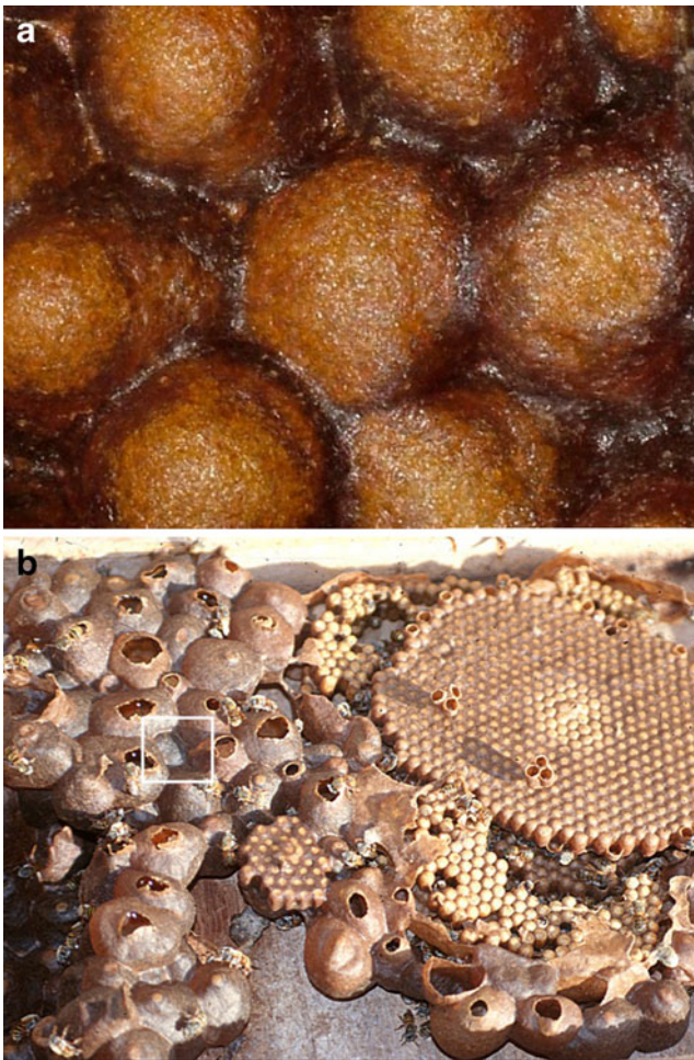
Fig. 1 Food pots in the stingless bee Tetragonisca angustula (a). The egg-shaped pots are often built close together with adjoining walls and can hold pollen or honey. In this example, six pots encircle a seventh pot that, as a result, has a hexagonal shape. Inside a nest of Melipona beecheii , referred to as M. domestica in the Origin (b). The food pots are the larger egg-shaped cells to the left and lower sides. The square shows a group of five pots encircling a pentagonal pot. The pots are arranged irregularly. By contrast, the brood cells, upper right, form regular combs of hexagonal cells. After being constructed, a brood cell is filled with food, the queen then lays an egg, and the cell is sealed. This gives a developing female larva some control over her caste fate as the same sized cells are used for rearing males, workers, and queens, one per cell. Photos taken by F. Ratnieks at Fazenda Aretuzina, São Simão, São Paulo, Brazil (a), and Merida, Yucatan, Mexico (b)